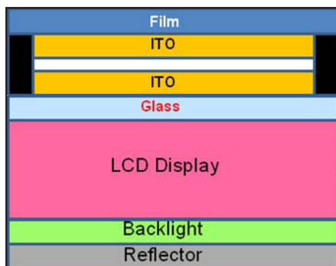
Resistive Touch Screen Construction

Traditional resistive touch screens have several drawbacks that are inherent in their basic design. They are constructed using several layers of different materials, starting with a flexible film for the top layer. This film has an undercoating of indium tin oxide (ITO), a transparent conductive material. Next is an air gap between this top layer and a second conductive layer. When the user presses on the top layer of film, the film and ITO deform (or bend) toward the lower layers of the screen until electrical contact is made with the bottom layer of ITO. This contact completes an electrical circuit between the two ITO layers and the touch screen controller interprets this as a touch. The air gap between the two ITO layers features tiny spacers (the black columns in the diagram) to maintain the proper distance between these two layers. One of the biggest drawbacks with this type of construction is the adverse effects it has on the optical clarity of images displayed on the screen. The film and spacers are responsible for some of the degradation, but the greatest distortion to optical clarity is often caused by light refraction and reflection between the two ITO layers.